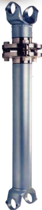
Power Train Saver®

As an Authorized Installer or Stocking Installer, your location and contact information will be promoted on our web site and at trade shows. We will literally send customers to your door!